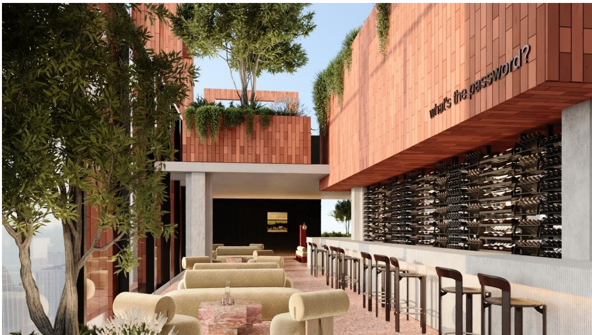
The proposed Victory Tower's rooftop bar.

A luxury tower with plans to operate as a high-end hotel with a rooftop bar and restaurants could be built next to Brisbane's oldest pub ahead of the 2032 Games.