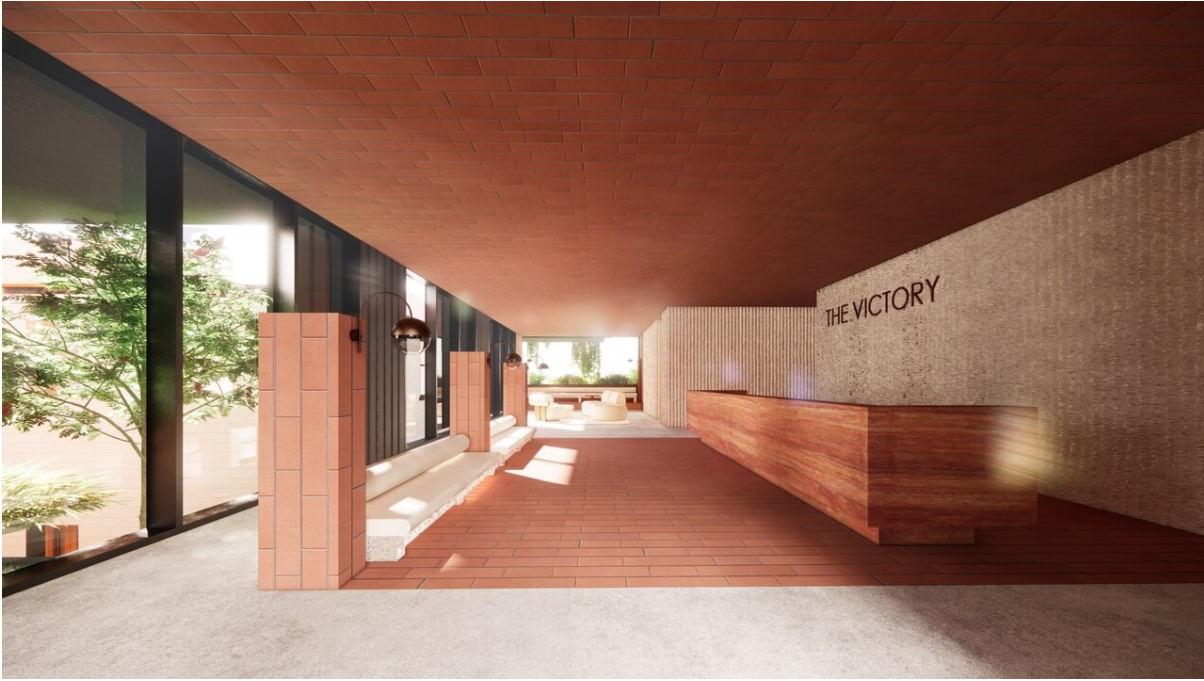
The proposed Victory Tower's foyer.