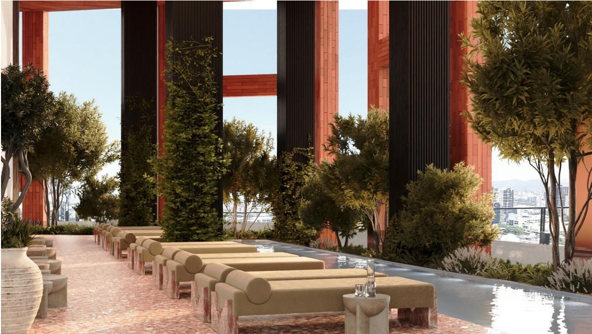
The proposed Victory Tower's pool area.