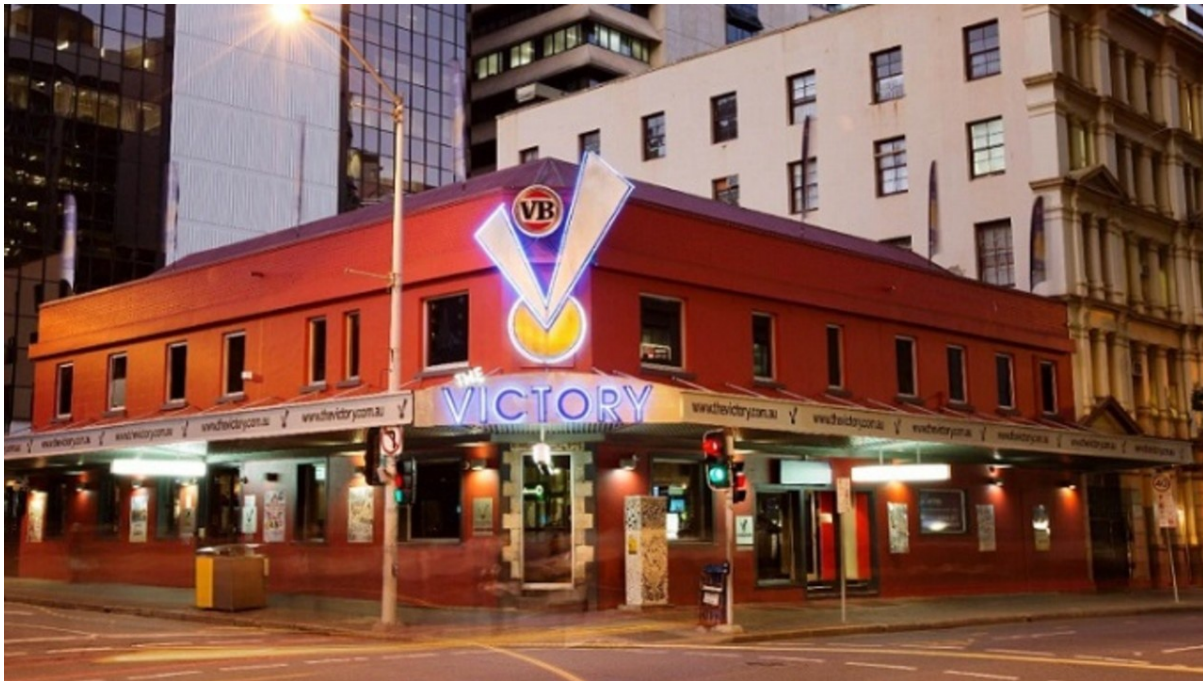
The Victory Hotel in Brisbane

Precision Group, the owners of the Victory Hotel are behind the development, which would be built on a 924 sqm site behind the iconic Brisbane venue, the Victory Hotel.