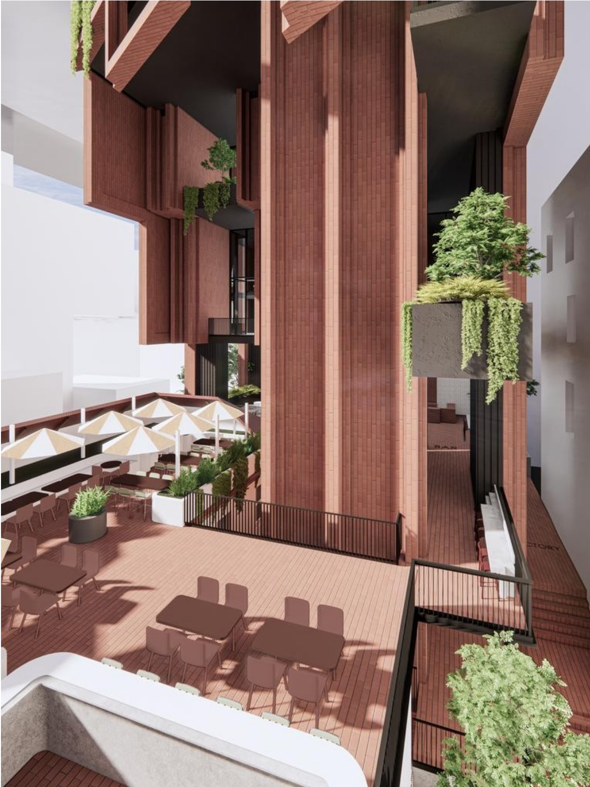
The podium area.

“We’ve drawn on the look and feel of the much-loved Victory Hotel to create what is ultimately a unique and contemporary urban landmark – one that supports Brisbane’s evolving tourism infrastructure ahead of the Games while still celebrating the sites historic roots.”