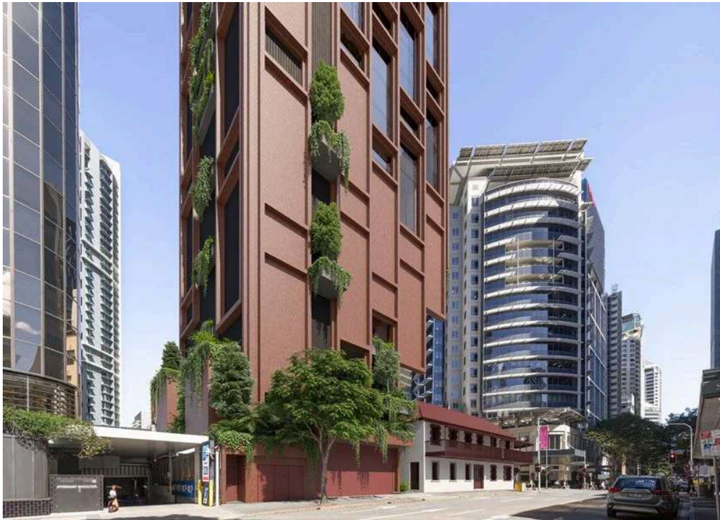
Concept design of the proposed hotel tower above the Victory Hotel in Brisbane