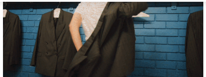
THE MATILDAS KIT TAKES A CENTRE PASS AT AUSTRALIAN ELEGANCE WITH FORMALWEAR UNIFORM COURTESY OF BEARE PARK