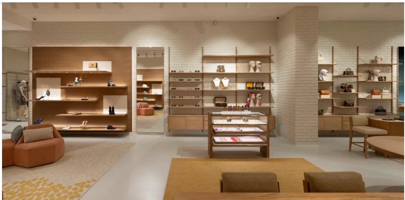
The new Louis Vuitton pop-up boutique in Adelaide, Australia.